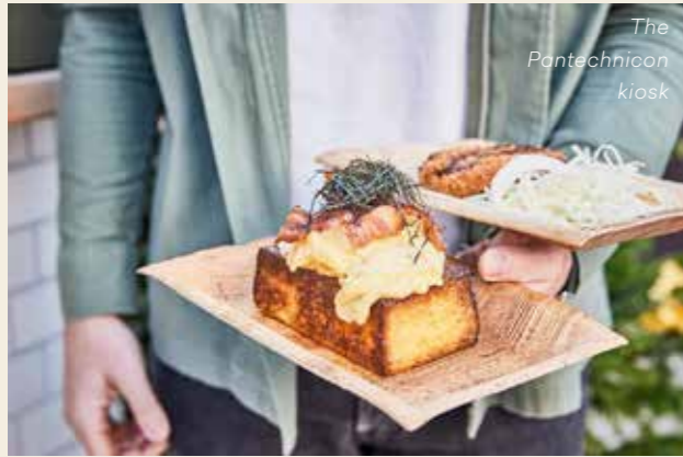
The Pantechicon kiosk

Belgravia. The team has also launched Sachi Yatai at The Kiosk in Halkin Arcade. This outdoor, takeaway concept sets the scene for a culinary tour of Japanese sweet and savoury street foods, paying homage to the traditional Yatai food carts seen in cities throughout Japan. Please take a look at the website for future opening times, pantechicon.com