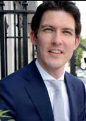
Above: Paul O'Grady

Please follow us on Instagram @belgravia_ldn