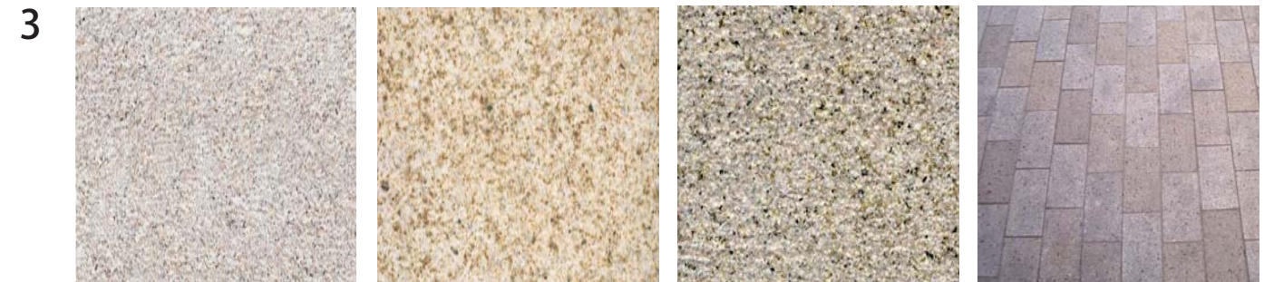
3 Delivery Bays/ Loading Pads & Pedestrian Crossovers: Granite Setts 250mm long x 150mm wide x 100mm thick. Paved area comprised of a subtle mix of tones; light pink, oatmeal, light beige.