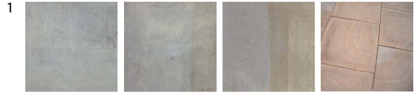
1 Pavements: Scoutmoor Yorkstone Flags 900mm long x 600mm wide x 75mm thick

Careful consideration has been given to ensuring that the number of different materials used within Mount Street is kept to a manageable minimum. This will help to ensure that surfacing materials create an underlying sense of order and harmony. It will also help to ensure that they relate to, and enrich, the character of Mount Street, and will simplify long-term management and maintenance.