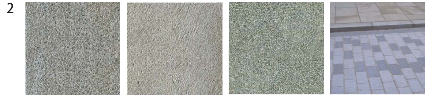
2 Car Park Bays: Granite Setts 250mm long x 150mm wide x 100mm thick. Paved area comprised of a subtle mix of tones; mid grey, dusky grey, dark green.