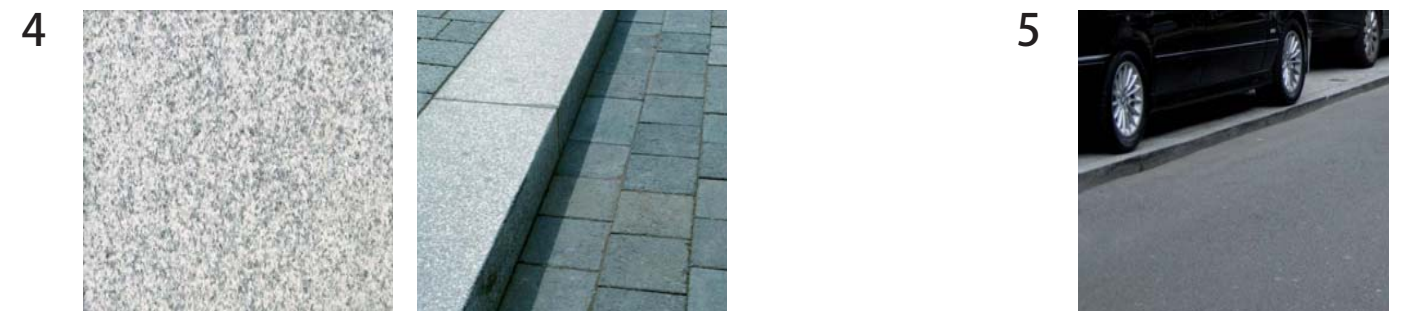
4 All kerbs: Granite 900mm long x 300mm wide x 200mm thick (100mm visible kerbface) Carriageway to be resurfaced with Hot Rolled Asphalt